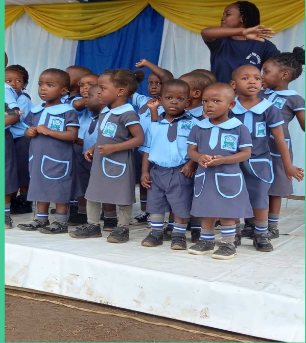
The Music Festival at Early Bird Education Center