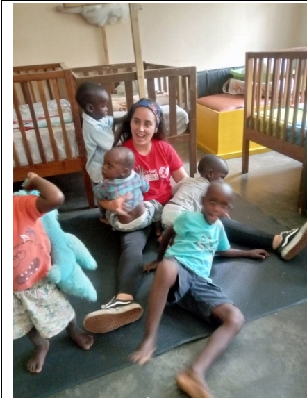
The volunteers help the mothers so much