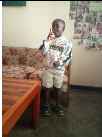
The volunteers bought him new clothes and shoes and the smile was on his face