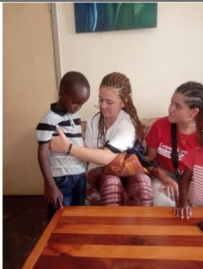
He was welcomed by the volunteers and they showed him real love