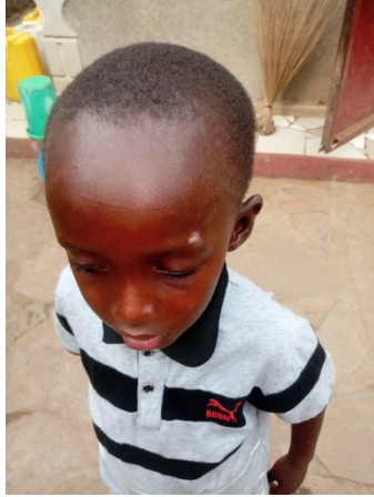
The whole body full of wounds