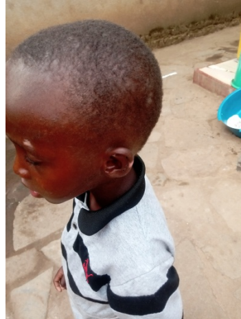
His head full of wounds and had no sign of happiness