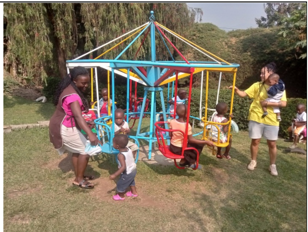
Children playing on the swings