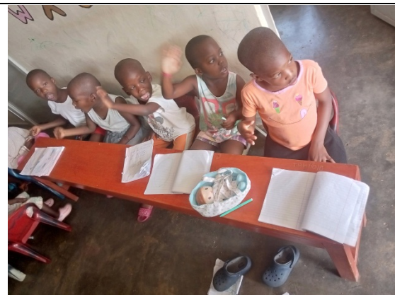
Children doing some work in class