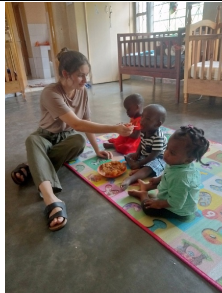
They feed the babies