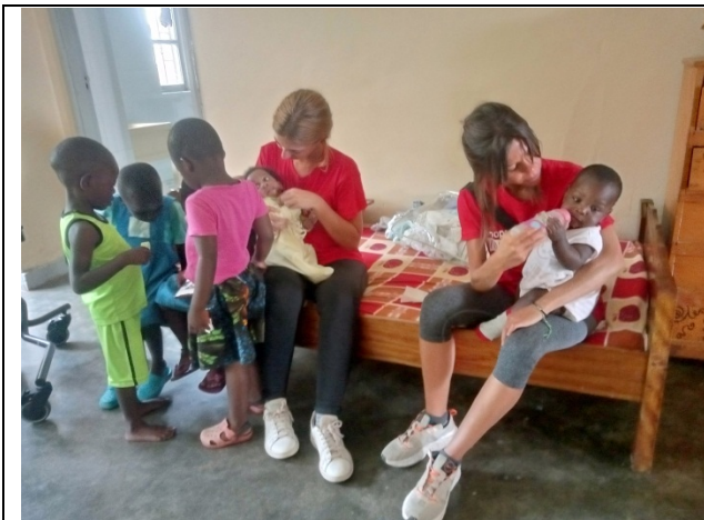
The volunteers feeding the babies