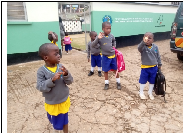
Children from school the last day of the term

The Home is moving on well with 54 children now, 30 boys and 24 girls. The Home has 22 Staff and 12 volunteers and they are doing a great job by attending to their regular duties.