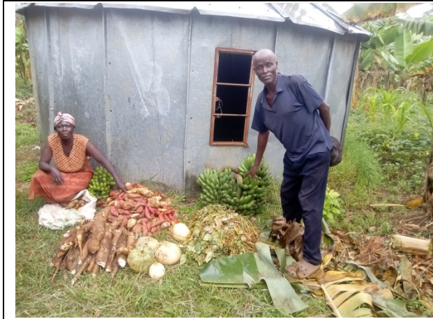
Harvested beans, matooke, cassava and a yellow banana, pumpkins and sweet potatoes