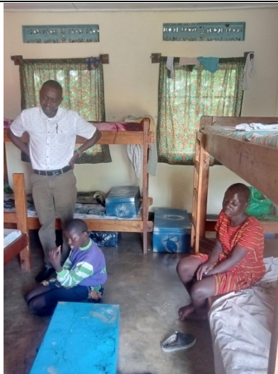
They reported back to school. The Head teacher welcomed them