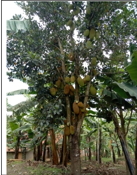
Jackfruit in Kagote has some ready fruits to be eaten