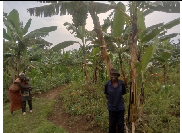
The plantation is looking good with some beans