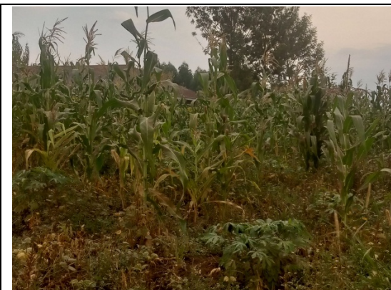
A garden of maize and beans

The farmers are doing well and we have more gardens of sweet potatoes.