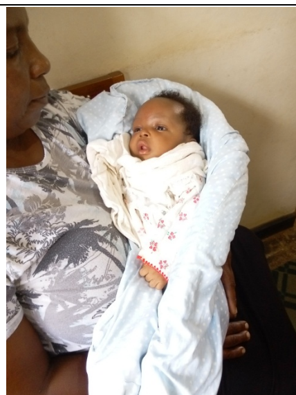
Mother taking him to hospital