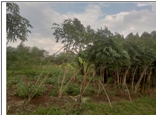
Cassava ready to be harvested