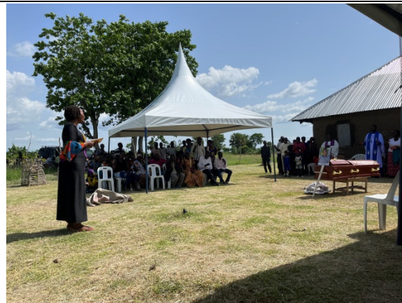
The Matron giving some remarks about her death