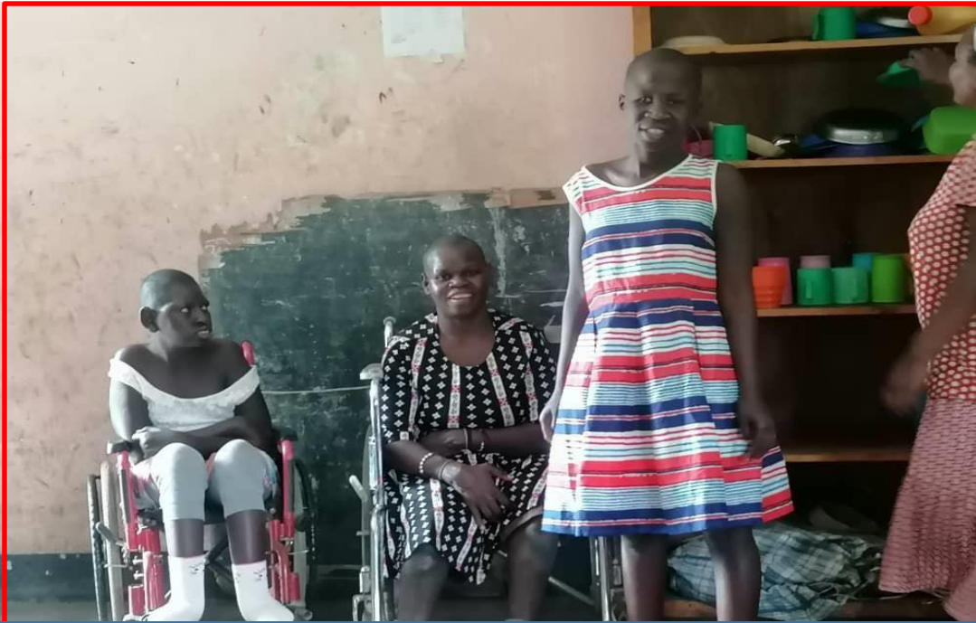
School going children to Canon Apollo School