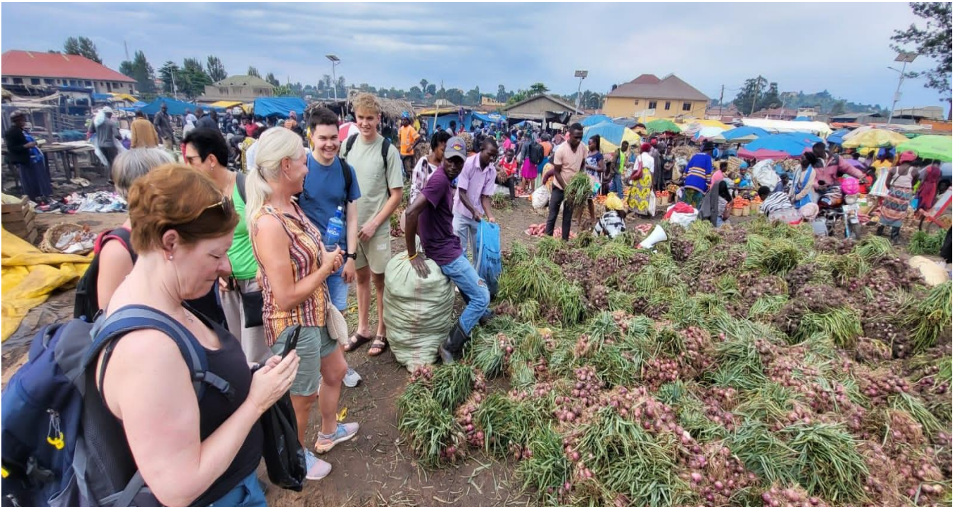
BELOW: Visitors from Norway doing shopping for TBH during market day.