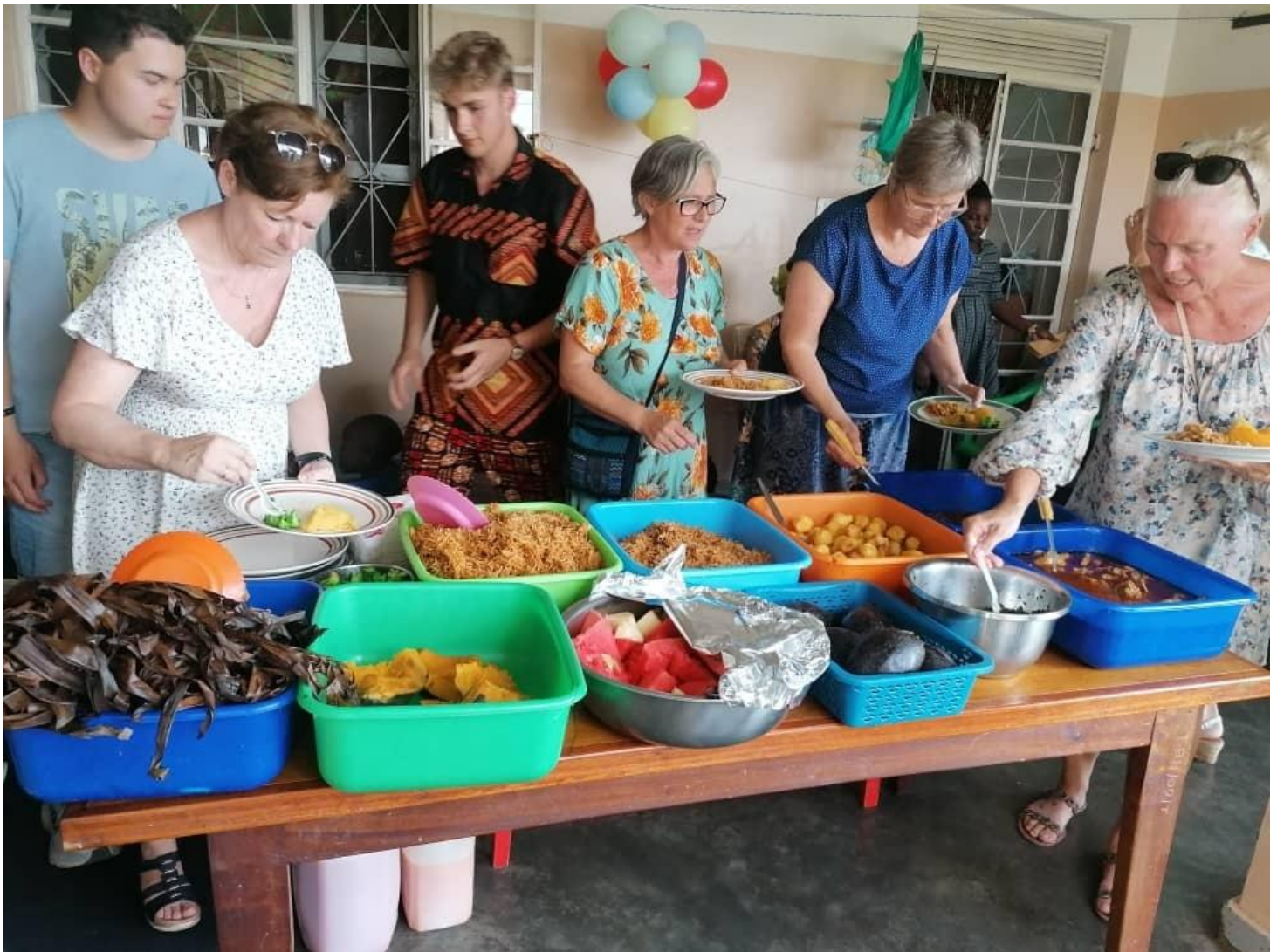
Fare well party to CNP and the Team at TBH