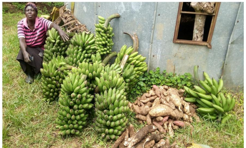
Groundnuts, pumpkins garden & Banana plantations and banana, sweet potatoes, cassava & pumpkins Harvests from Kasiisi TBH farmland.