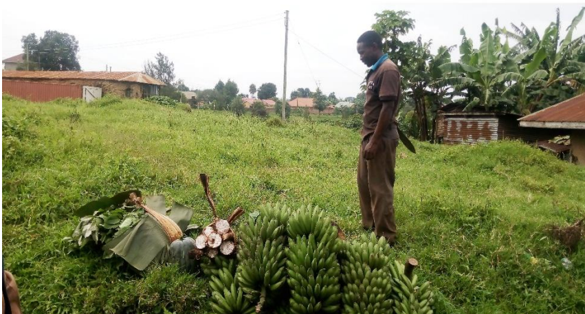
Green, Banana plantations and Harvests from Kagote TBH farmland.