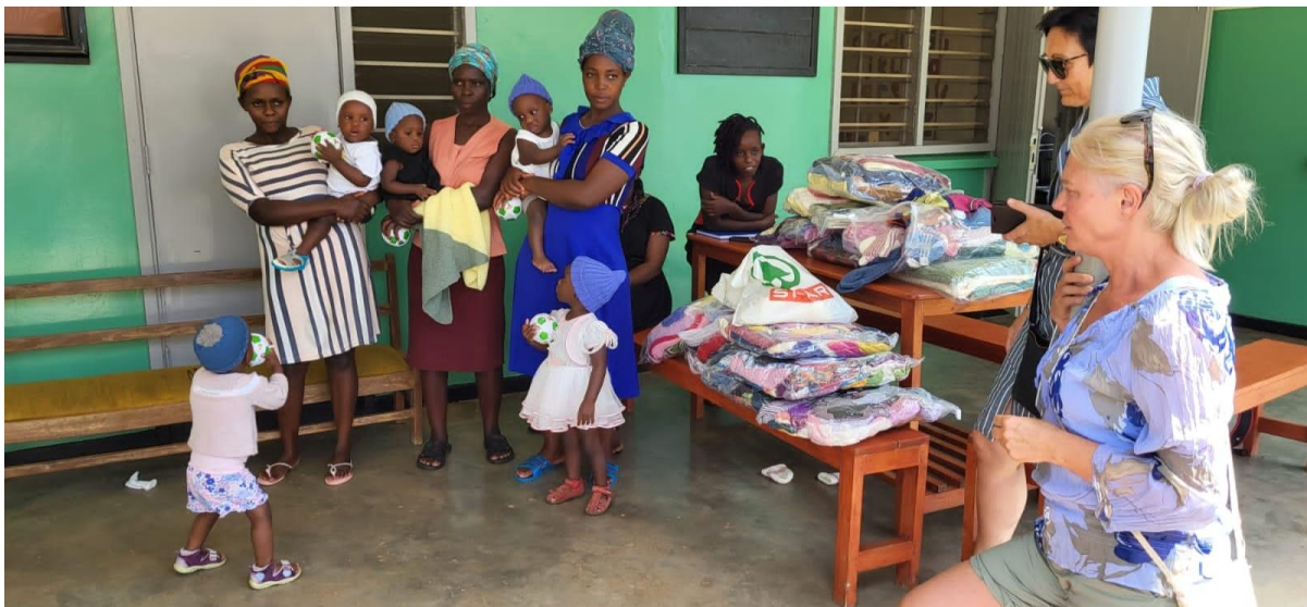
Some of the Donations from CHILDREN NEED PARENT (CNP)