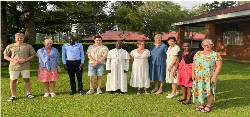
The trustees and CNP