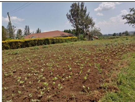
New beans garden