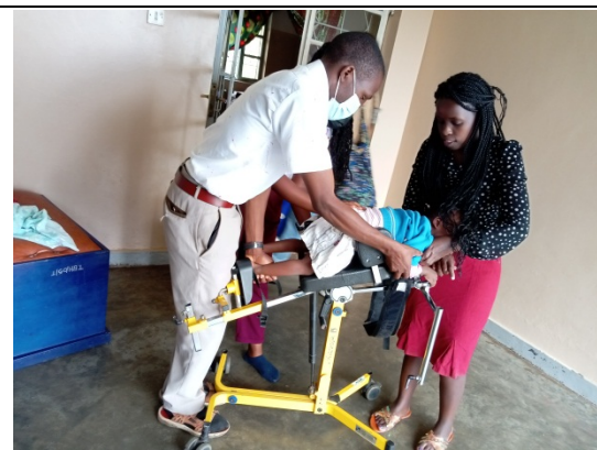
Working on Gift