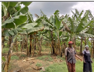
The gardeners do a lot of work