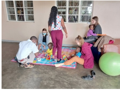
Training volunteers going on