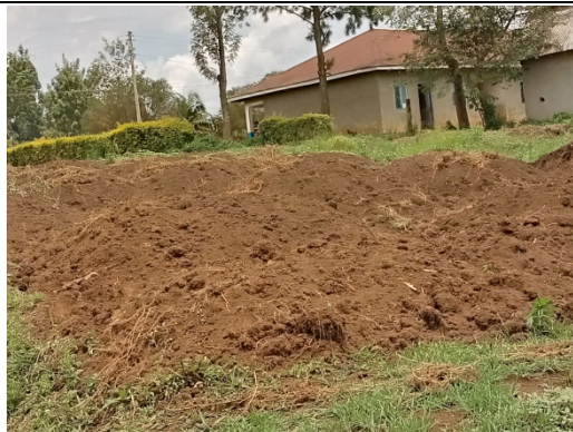
New garden for irish potatoes

Kasiisi is doing well. We are now preparing our new gardens to plant new crops like beans, maize, sweetpotatoes, cassava and many others.