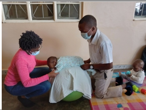
Working on Aggrey