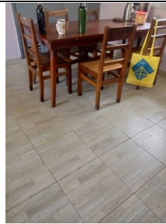
Our dining room so nice