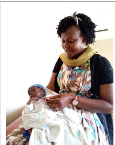
He is so jolly