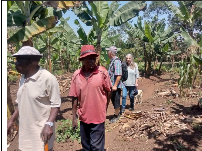
The 2 farmers with the visitors