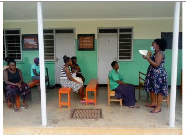
Some questions were asked and staff answered