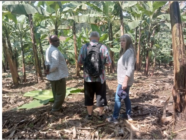
Our donors visited Kagote plantation

Some donors from Children Need Parents visited us and we moved around with them in our farms. We were so happy for all the efforts they normally put in to make the Home move on well.