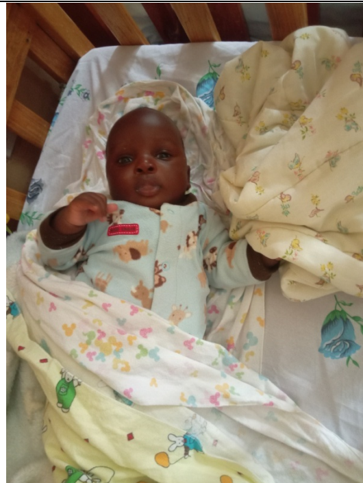
He looks so health