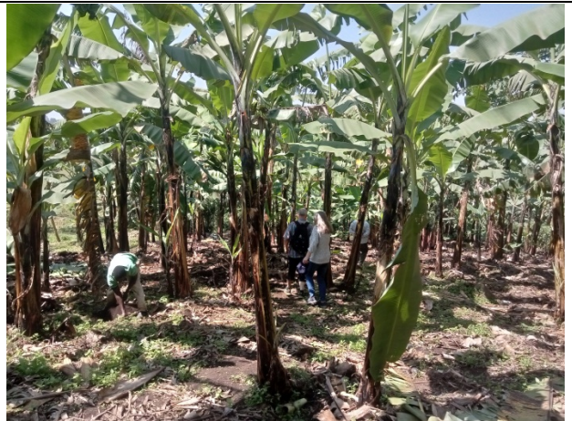
Tadeo working in the plantation