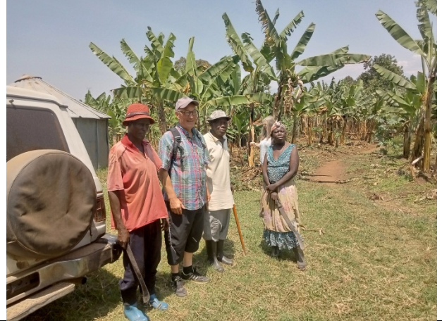
They have done a great job to give us food