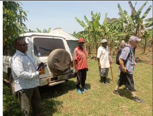
The visitors appreciated the work well done