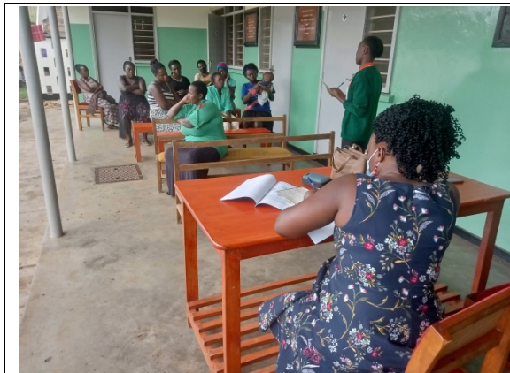
Staff health education going on