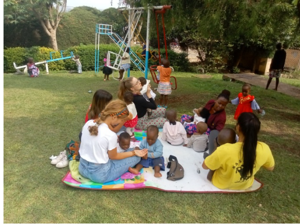
Some volunteers with children