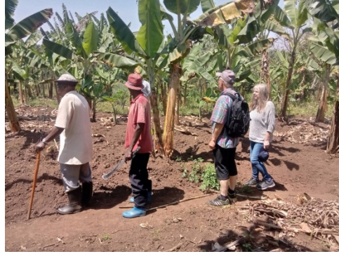
The donors also visited Kasiisi farm